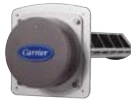
Performance Carbon Air Purifier with UV